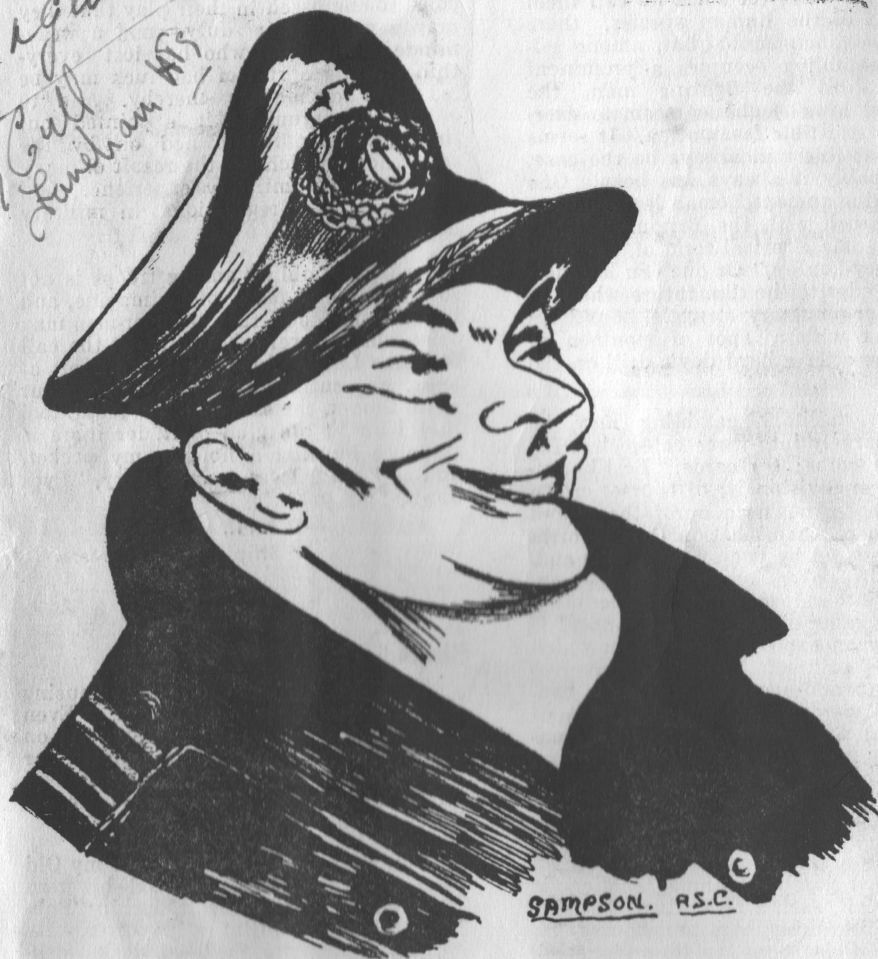
"THE OLD MAN"