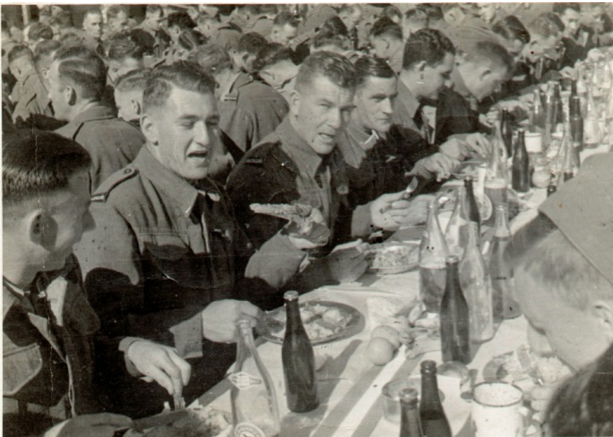
Christmas dinner at Maadi camp, Egypt, 1942